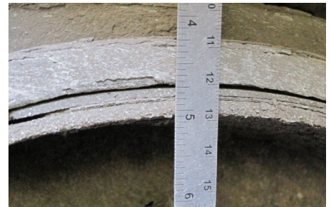
Worn out linings. OOSC, Part II, a.(5)(c)vii / 393.47(d)(2)-U.S.