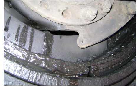
Contaminated lining. OOSC, Part II, a.(5)(c)vi / 393.47(a)-U.S.