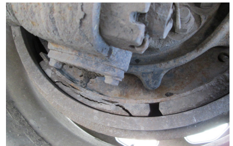
Cracked lining. OOSC, Part II, a.(5)(c)iii / 393.47(a)-U.S.