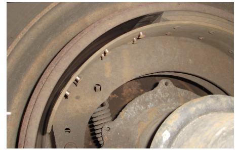
Missing lining block. OOSC, Part II, a.(5)(c)ii / 393.47(a)-U.S.